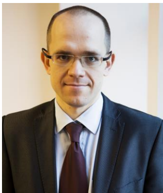
Evgeny Morozov , Author and editorialist

Economist at the University of Paris I Pantheon Sorbonne and the CNRS lab (National Center for Scientific Research) at the CES (Center of Economy at the Sorbonne), Institutional Axis. He is a key figure in research on cognitive capitalism.